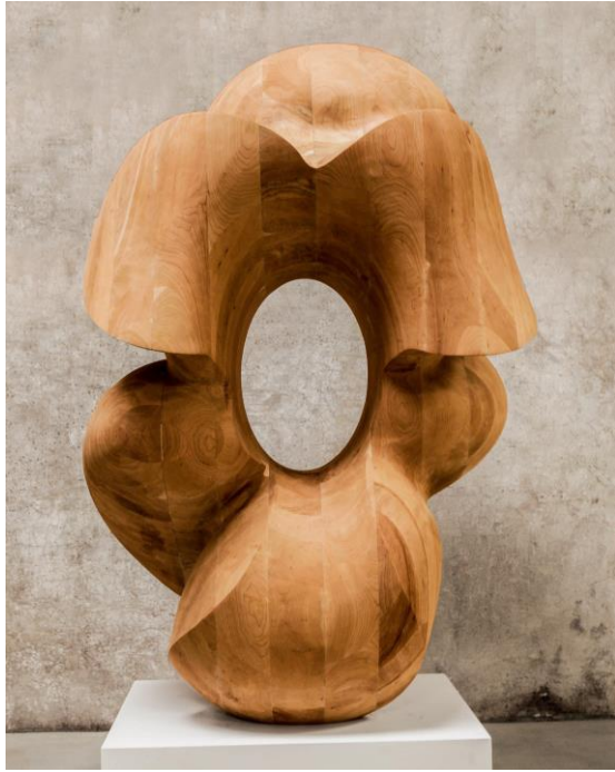
Outburst (2016) wood 87" h