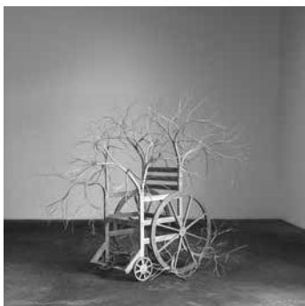
Pontus Willfors, Wheelchair , 2018, ash and white oak wood, 63 x 70”, is currently on view at Denk.

“Shop” is a collection of wooden and aluminum sculptures, many based on themes of transportation. Pontus Willfors has a knack for carefully crafting recognizable objects — cars, bicycles and other utilitarian objects. The highlights in this exhibi-